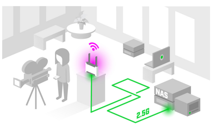
Cynthia is a video editor. She uses the 2.5 Gigabit Ethernet to reach her NAS server with all the large media files. The LTE6 modem is her main connection to the outside world – with all the messengers, online meetings, and the occasional 4K movie streams.

Compared to the regular Chateau LTE6, this version features a supercharged quad-core ARM CPU running at 1.8 GHz . It can handle even the most complex tasks without breaking a sweat. You can run complex firewall rules, provide encrypted VPN tunnels for an entire office, run the most demanding container apps right on your router, and more! The addition of 2.5 Gigabit Ethernet gives you even more options . You can use the ultrafast port to connect extra devices – like a home media server – or use it as your primary ISP connection while keeping the LTE modem for backup.